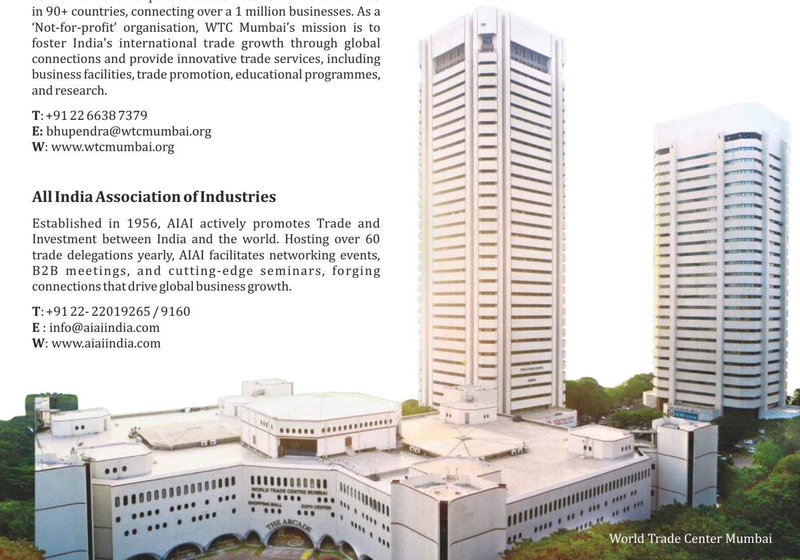
World Trade Center Mumbai

Conference Fee includes: Participation for 1 person in Sessions, Networking Lunch, Welcome Reception and visit to the Exhibition.